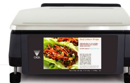
7" WVGA Customer Display